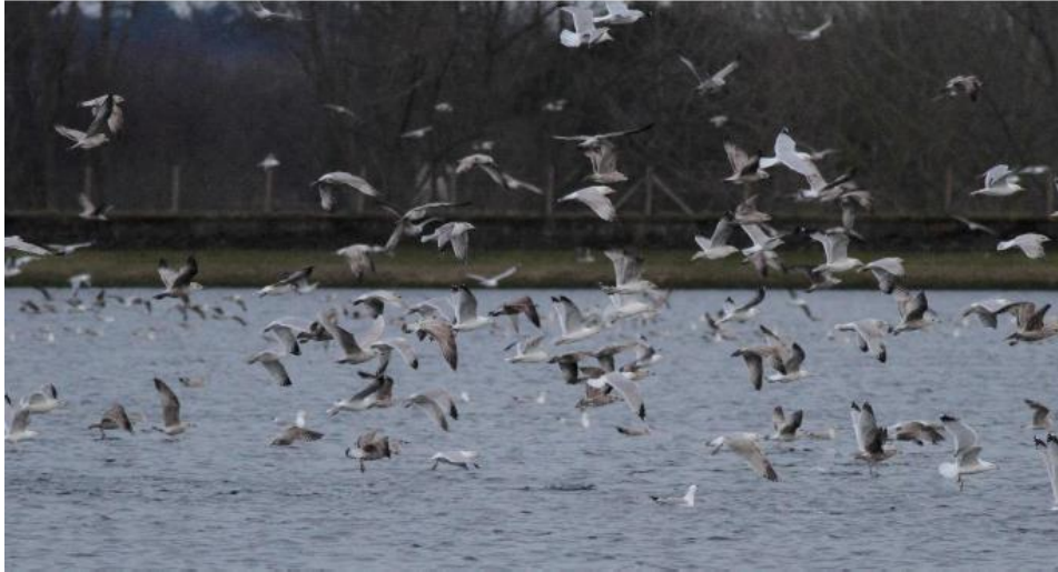
Part of Rother District's threatened ornithological assets