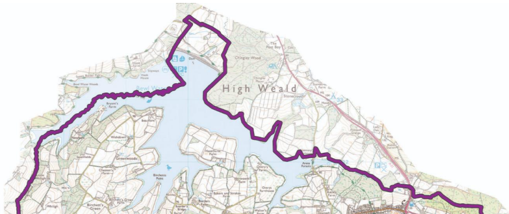
Figure 41 The purple line is Rother District boundary. The area south of the line is Rother District. The area to the north-west is Wealden District Council. The area to the north-east is Tunbridge Wells District Council.

11.36 Bewl Water is located within the High Weald National Landscape and is at the northern point of Rother District Council, between Wadhurst and Ticehurst in Sussex.